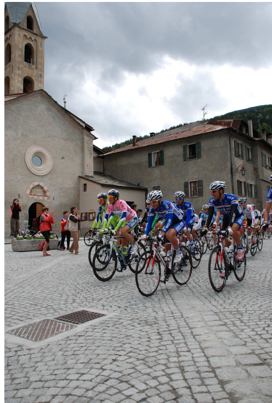
The giro in piazza di Combo—Bormio

But at the end the Giro's last mountain stage revealed itself calmer than expected for Ivan Basso (the pink jersey). The frightening five peaks, among which the terrible Gavia - still a question mark due to inclement weather -, only generates some unrealistic attempts by Sastre and Vinokourov during the initial climb. The stage, 178 kilometres from Bormio to the Tonale Pass, livens up at last during the final kilometres when Evans hurls forward. He disrupts the pack of hard-hitters in his pursuit of the podium. The Giro 2010 ended with the time trial in Verona on the day of Ivan Basso's official triumph.