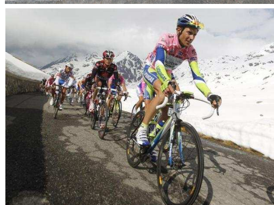
Gavia descent